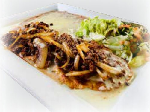
• • POLLO TOLUCA

Pollo Poblano Two marinated chicken breasts topped with grilled onions, mushrooms and poblano pepper slices covered with cheese sauce. Served with rice, your choice of refried black or pinto beans and flour or corn tortillas – 16.50