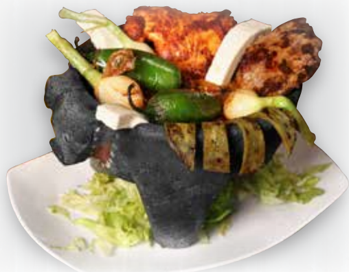
• • MOLCAJETE

Pollo Loco Marinated grilled chicken breast in our special sauce topped with cheese sauce. Served with Mexican rice, your choice of refried black or pinto beans, lettuce, tomatoes and sour cream – 15.50