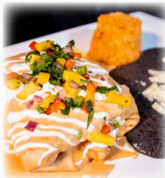
• • CHIPOTLE CHIMICHANGA

A flour tortilla deep-fried to a golden brown and filled with grilled onions, bell peppers, tomatoes, zucchini and mushrooms. Topped with our homemade cheese sauce – 16.99