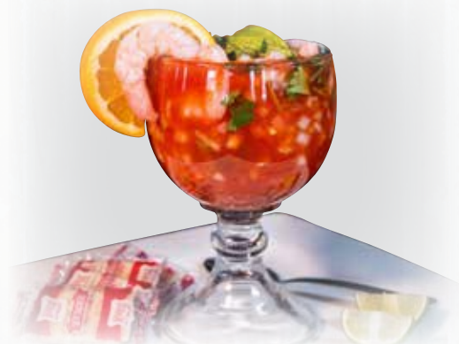
• • SHRIMP COCKTAIL

Mexican Hamburger Cheeseburger with mayonnaise, lettuce, tomatoes, onion and avocado. Served with French fries – 11.99