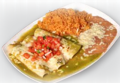
• • ENCHILADAS SUIZAS