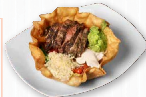
• • FAJITA TACO SALAD

Fajipiña Marinated chicken, sirloin steak and shrimp grilled with pineapple, bell peppers, onions and tomatoes, all served in a half pineapple – 23.99