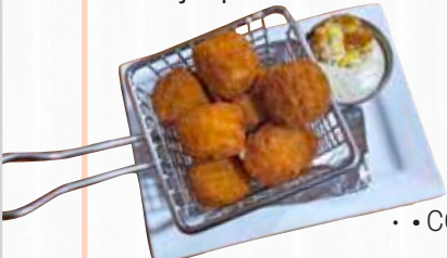
• • CORN KICKERS

Twelve sweet corn kennels, jalapeños, cream cheese and bacon all battered and fried crispy. Served with jalapeño ranch – 8.99