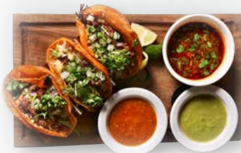
• • QUESABIRRIAS

Three corn tortillas with melted cheese stuffed with slow-cooked beef topped with red onion and cilantro. Served with consommé, lime and mild and hot salsas - 17.99