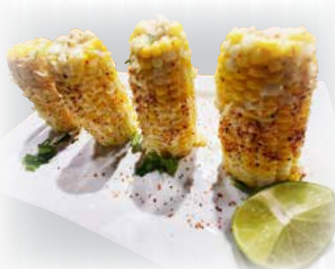
• • ELOTES