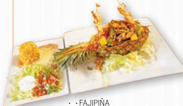
• • FAJIPÍÑA