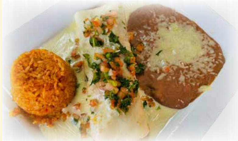
• • BURRITO MAYA

A flour tortilla stuffed with grilled chicken, Mexican chorizo, rice and refried beans, topped with cheese sauce and pico de gallo – 15.99