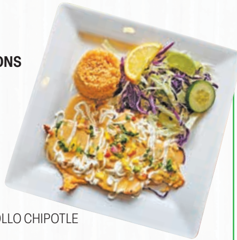
• • POLLO CHIPOTLE

Pollo Ranchero Grilled chicken breast smothered with cheese sauce and a touch of ranchero sauce. Served with Mexican rice, your choice of refried black or pinto beans, lettuce, sour cream and tomatoes – 15.99