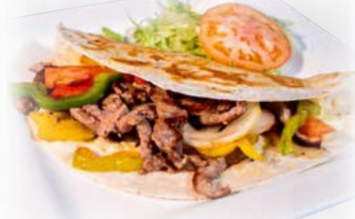
• • FAJITA QUESADILLA