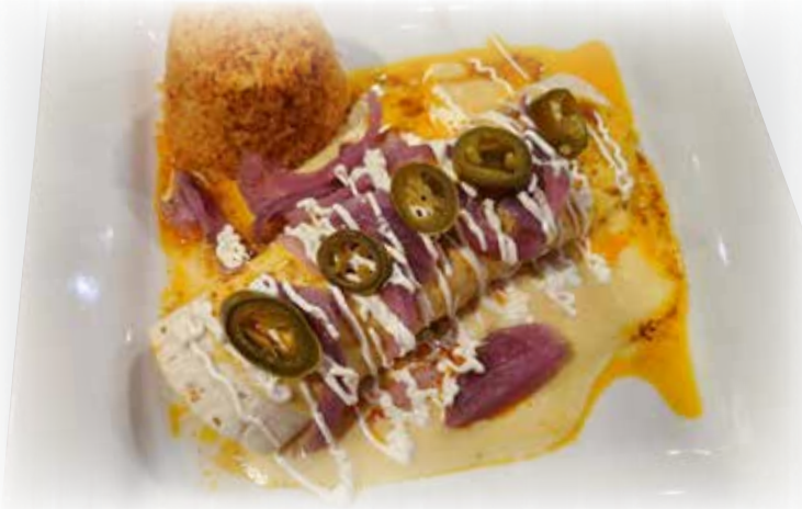
• • BURRITO COCHINITA

- SHREDDED CHICKEN IS PRECOOKED WITH ONION, BELL PEPPER, TOMATO AND MEXICAN SPICES. ASK YOUR SERVER ABOUT MENU ITEMS THAT ARE COOKED TO ORDER OR SERVED RAW.