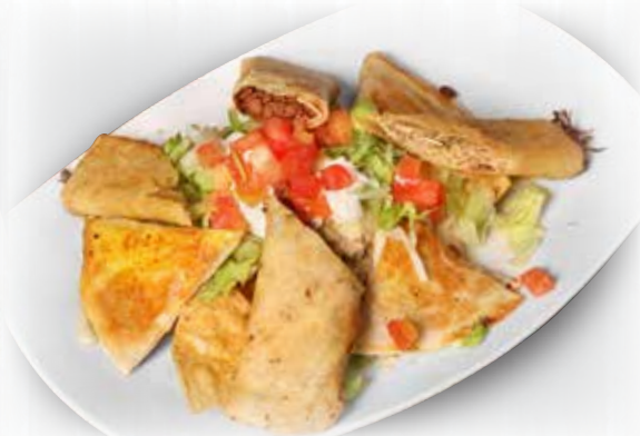
• • SAMPLE PLATTER