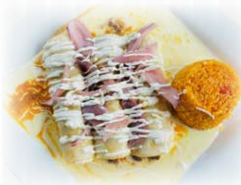
• • ENCHILADAS COCHINITA