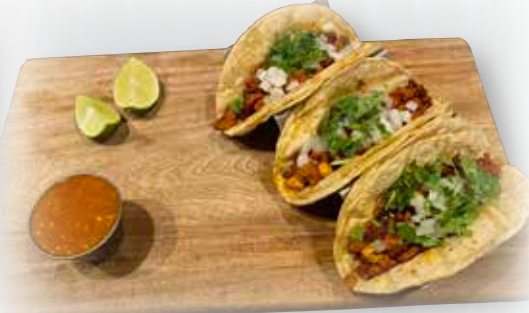
• • TACOS AL PASTOR