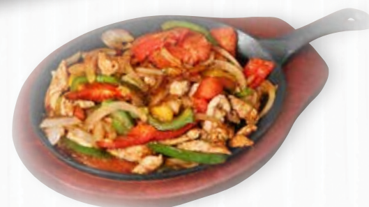
• • CHICKEN FAJITAS