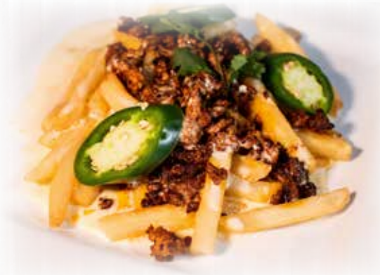
• • CHORI-PAPAS