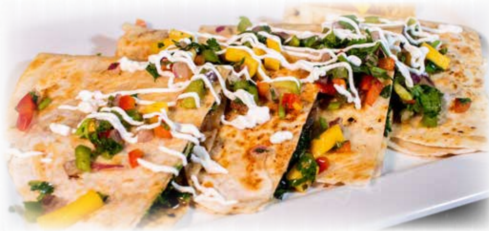
• QUESADILLA VEGETARINA